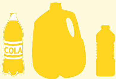
Plastic Screw-tops Bottles & Jugs without Lids